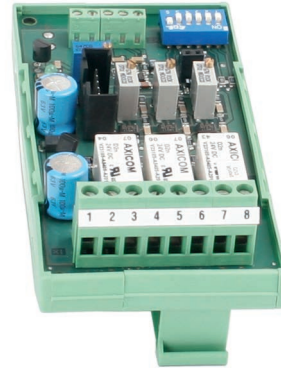
Analogue limit switch, model EGS01